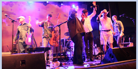
After almost a half century absent from the stage, The 13th Floor Elevators take a bow.

Hats off to LEVITATION's producers - they accomplished nothing less than a miracle. There are rumors in the wind of another show in Los Angeles this summer.