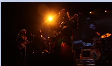
Roky Erickson & The Elevators

I was asked by a friend the other day what I thought of the 13th Floor Elevator reunion at Psychfest May 10th in Austin and I replied, "There just aren't words." My publisher reminded me that there had better be at least 500. No problem.