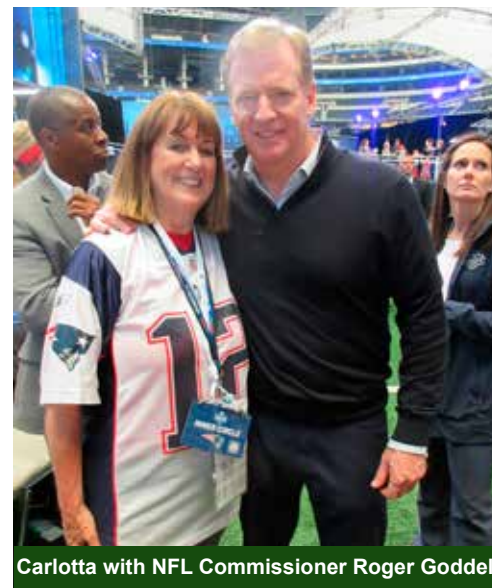
Carlotta with NFL Commissioner Roger Goodell

Short crisis – I forgot my jersey to change into – $14.99 later, I was in a Gronkowski T-shirt. To kill time until the draft, we visited the displays of locker rooms, uni-